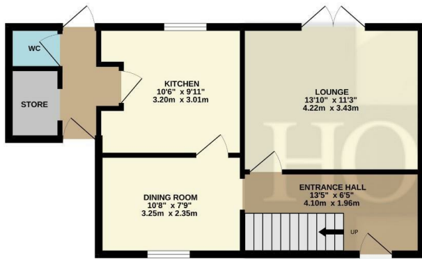
GROUND FLOOR 505 sq.ft. (46.9 sq.m.) approx.